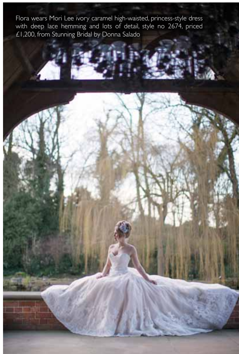
Flora wears Mori Lee ivory caramel high-waisted, princess-style dress with deep lace hemming and lots of detail, style no 2674, priced £1,200, from Stunning Bridal by Donna Salado