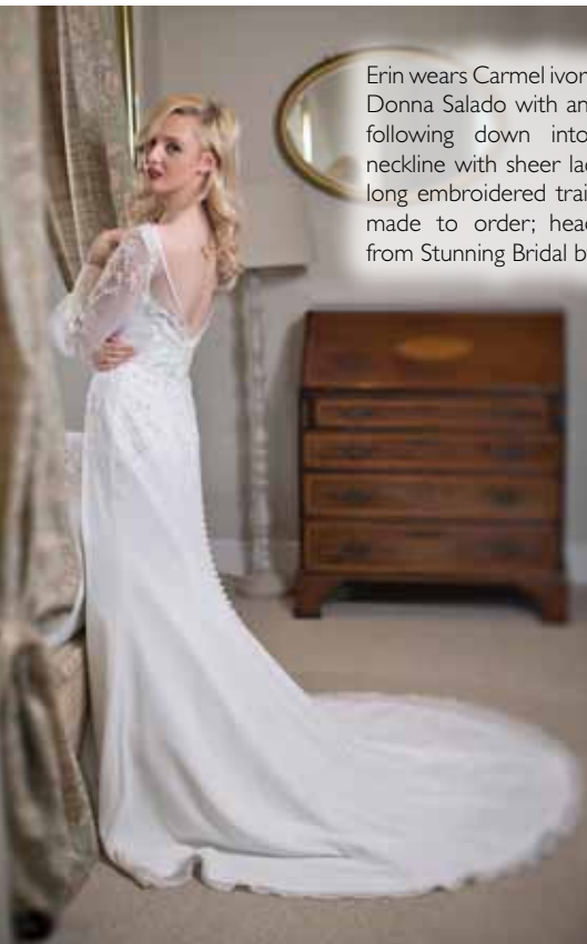
Erin wears Carmel ivory chiffon dress by Donna Salado with an illusion neckline following down into a sweetheart neckline with sheer lace sleeves, and a long embroidered train. Dress, £1,250, made to order; headpiece, £145.50, from Stunning Bridal by Donna Salado